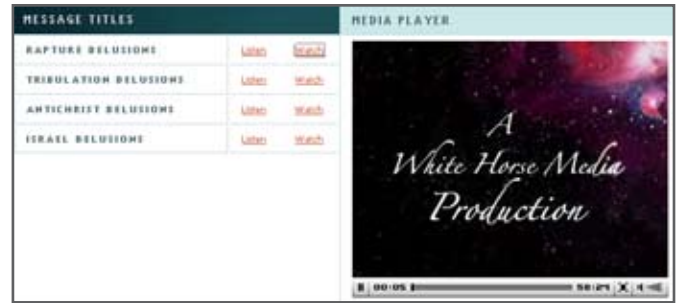
Fig. 1 | White Horse Media Web Site Streams Flash Video

—Aaron Roberson, Webmaster, White Horse Media